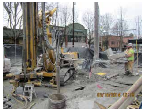
Testing underground conditions sometimes involves working in city-center locations.

Sound Transit said it considers the geological environment, engineering and construction needs, property access, contracting method, time constraints and cost-benefit analysis when planning underground investigations. It also said fully understanding underground conditions by increasing the amount of exploration is not always practical. It hires design consultants to prepare and implement